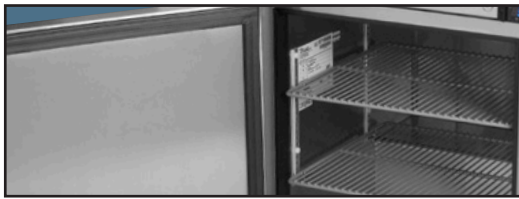
Stainless steel liner.