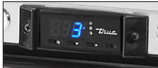
Exterior digital temp display