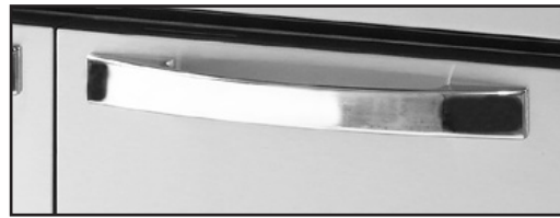
All metal working spec door handle