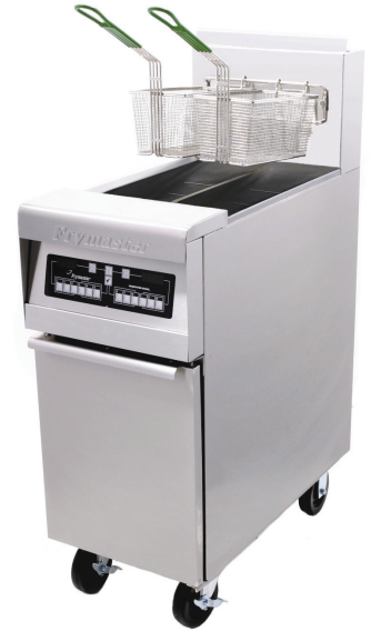
PH155-2C shown with optional castors