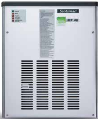
Nugget ice 1g – Ø11mm x H 13mm