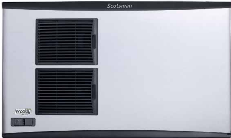
Dice cube 10 g W 22 x D 22 x H 22 mm