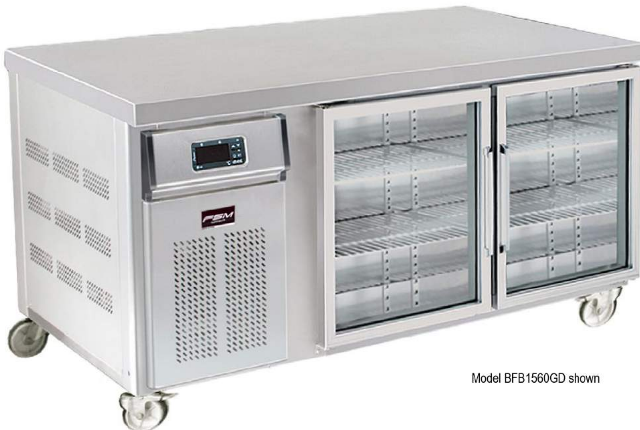
Model BFB1560GD shown