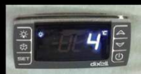
Easy to use digital control