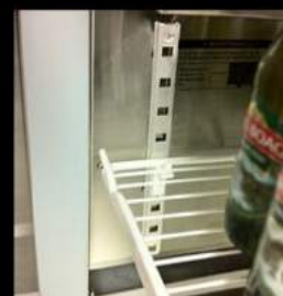
Adjustable epoxy coated shelves