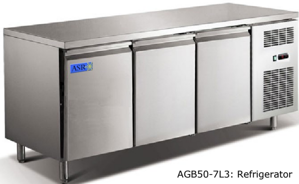
AGB50-7L3: Refrigerator AFB50-7L3: Freezer

Note: Photo Show cabinets fitted with optional legs. Overall height on standard castor 880mm.