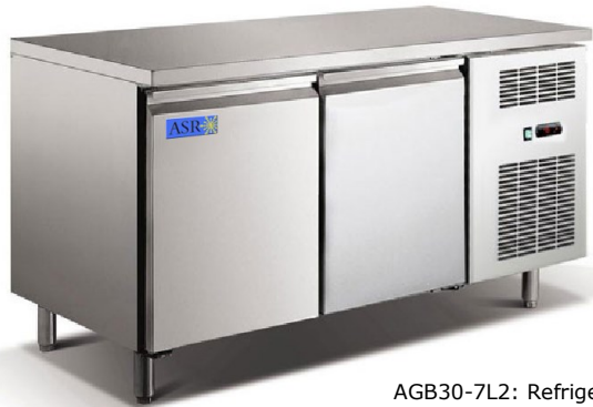
AGB30-7L2: Refrigerator AFB30-7L2: Freezer