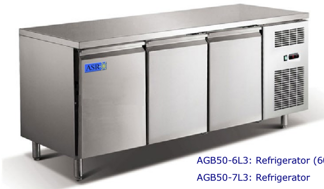
AGB50-6L3: Refrigerator (600mm Depth) AGB50-7L3: Refrigerator AFB50-7L3: Freezer

700mm models shown. Shown with optional legs.