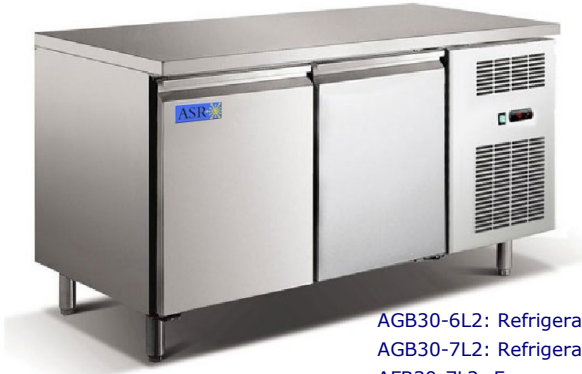
AGB30-6L2: Refrigerator (600mm Depth) AGB30-7L2: Refrigerator AFB30-7L2: Freezer