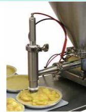
Vertical diving nozzle

Applications: Easy spot deposits on trays or into shells