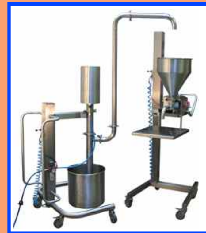
Note: Image shows DEP5-670 Depositor & PUMP1050 Transfer Pump