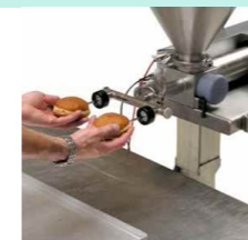
Double spout + injections

Note: the decoration head must be used in conjunction with the vertical diving nozzle.