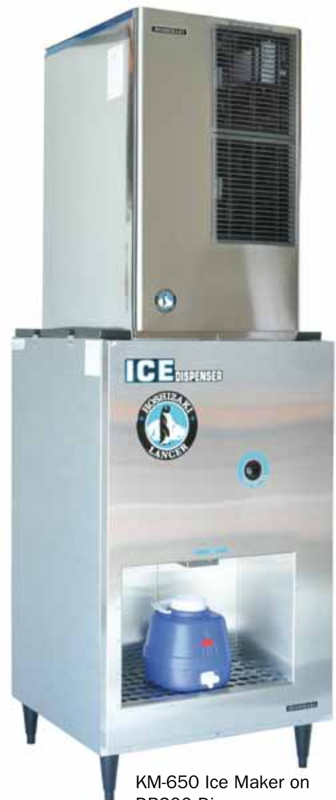
KM-650 Ice Maker on DB200 Dispenser