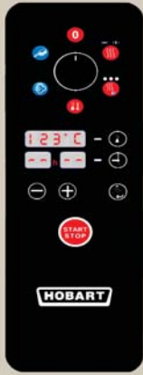
> Hobart Combi® Oven HF Series Control Panel