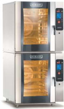
&gt; 102 – 10 tray x 2