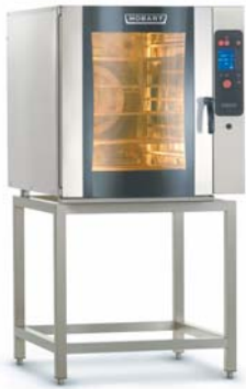
&gt; 101 – 10 tray