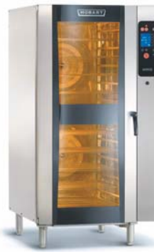
&gt; 201 – 20 tray