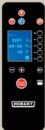
> Hobart Combi® Oven HFE Series Control Panel