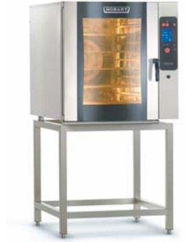
> 61 – 6 tray

Reduced energy use. When the oven reaches your set temperature, it automatically reduces to half-power—without affecting cooking times or temperatures. Ovens can be preheated automatically so you're ready to go first thing in the morning, and you save time, too.