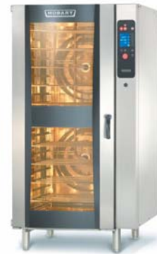
&gt; 201 – 20 tray x 2