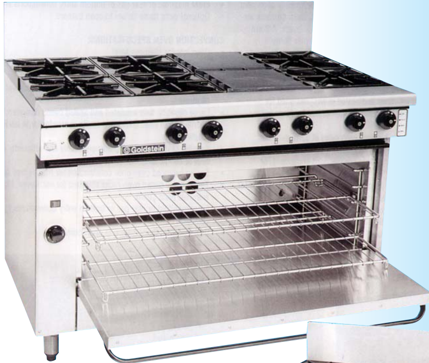
Fan Forced Convection oven Electric PFC-8-40E