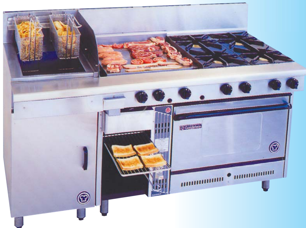
Model PF-24G-4-28/SA/FRGI Multi-1