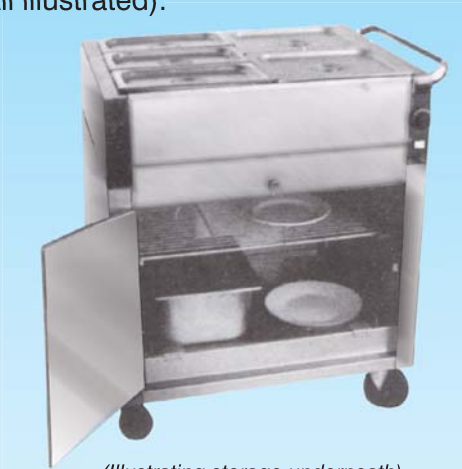
(Illustrating storage underneath)