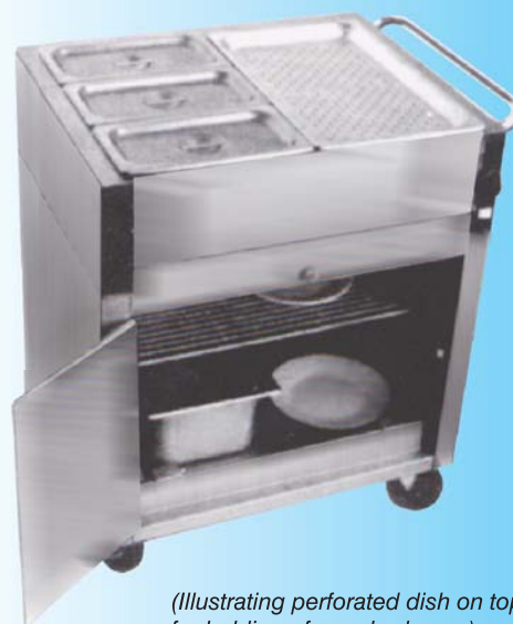
(Illustrating perforated dish on top for holding of poached eggs)