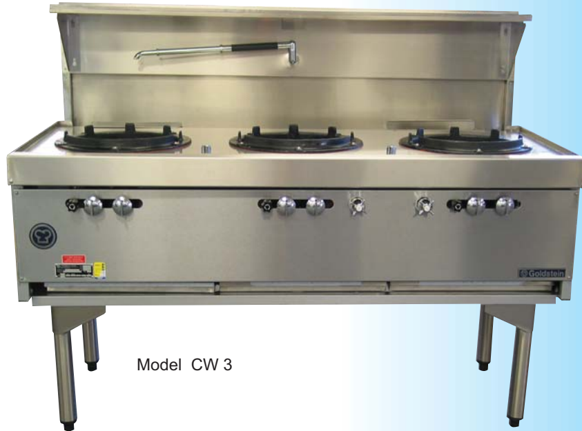
Model CW 3