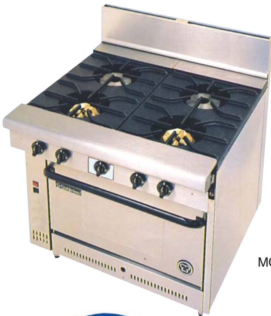
MODEL CS9004/28 Static Oven