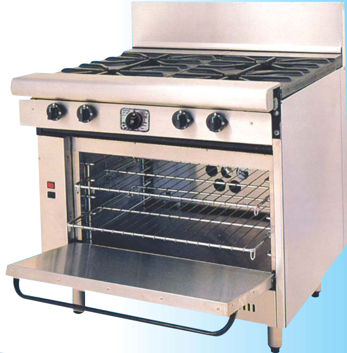
MODEL CS9004/28C Convection Oven