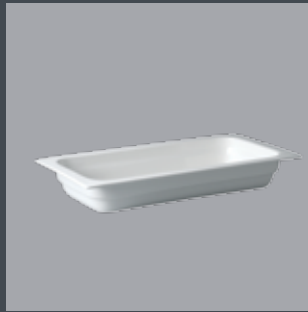
GASTRONORM RECTANGULAR PAN BGN13002A l 330 x w 170 x h 68mm 2000ml