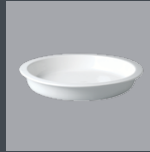
GASTRONORM ROUND PAN BGN39002A d 385 x h 60mm 4400ml