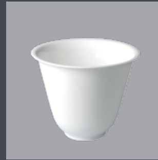
WINE COOLER BWB25002A d 248 x h 198mm 4270ml