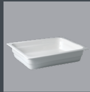
GASTRONORM RECTANGULAR PAN BGN12002A l 331 x w 265 x h 68mm 3300ml