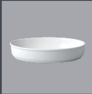
OVAL DISH BOD25002A l 245 x w 180 x h 48mm 1100ml BOD28002A l 284 x w 195 x h 58mm 1800ml BOD30002A l 299 x w 209 x h 61mm 2100ml BOD37002A l 374 x w 257 x h 58mm 3000ml