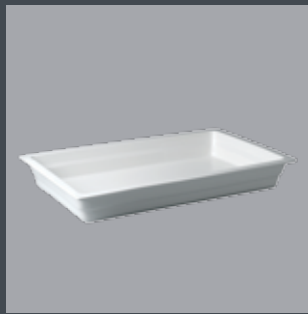
GASTRONORM RECTANGULAR PAN BGN11002A l 532 x w 330 x h 71mm 8200ml