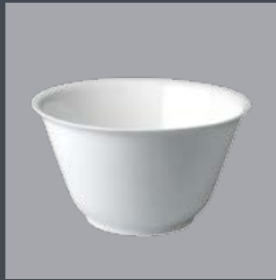
SALAD BOWL XXL BSB31002A h 170 x d 307mm 6320ml