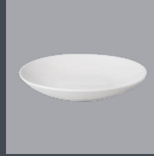
COUPE BOWL BBC26002A d 261 x h 46mm 1250ml BBC30002A d 300 x h 56mm 2000ml