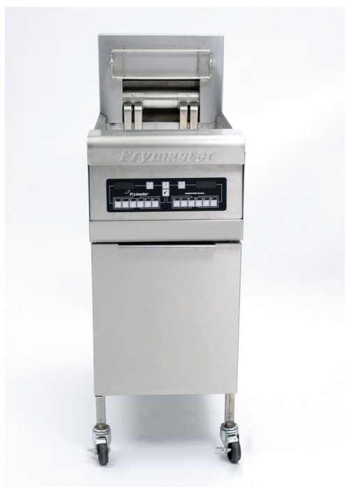
shown with optional castors and computer controller

SPECIFICATIONS ARE SUBJECT TO CHANGE WITHOUT NOTICE.